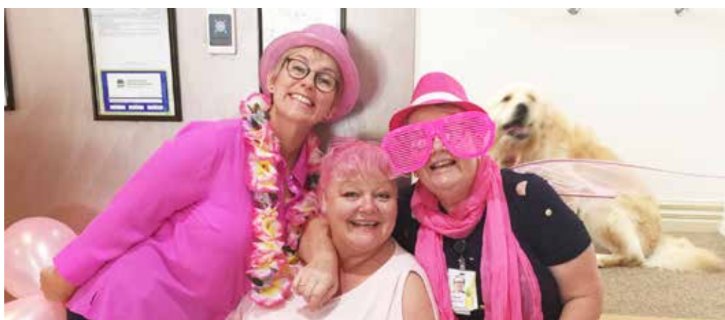
Page 14: Chamberlain Gardens staff promote "The CAC Way".

Volunteers, staff and residents gathered in May to celebrate and rededicate Maranatha's cafe.