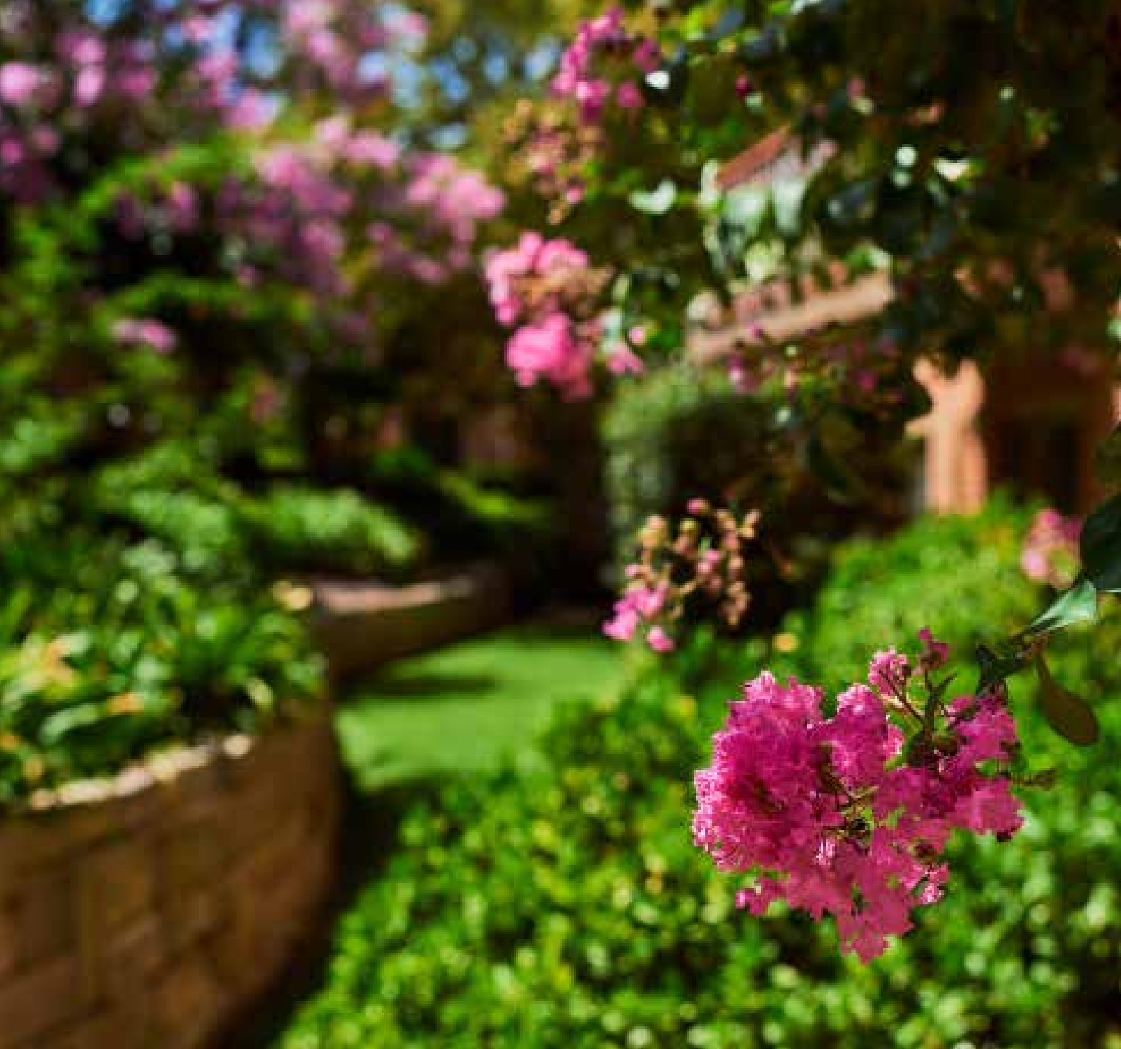
The beautiful gardens at Courtlands Village, North Parramatta